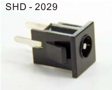
SHD - 2029

0.3A 30V DC -2029 Pin Ø 2.0mm -2029A Pin Ø 2.5mm