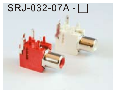
SRJ-032-07A - □

0.3A 16V DC TV Jack □ = Color R = Red W = White Y = Yellow B = Black