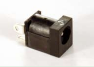
SHD - 2013

2A 16V DC -2013 Pin Ø 2.0mm -2013A Pin Ø 2.5mm