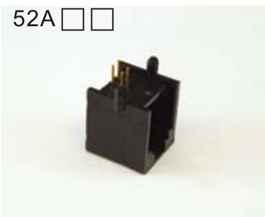
52A □ □

Modular Jack 1.5A 150V AC Black & Grey Color □ = Position 4 = 10.0 x 13.0 x 14.5 mm 6 = 12.0 X 13.0 x14.5 mm □ = Contacts = 2 , 4 , 6 , 8