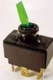
SW - 2726 - C3 - 2L

15A 12V DC/15A 125V AC Mounting Hole: Ø 12.0mm DPDT ON - OFF - ON With Two Lamp