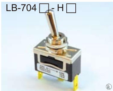
LB-704 □ - H □

SPST(2PINS) 15A 125V AC/10A 250V AC Option of Function: 1.5.7