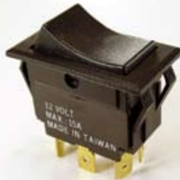
SW - 2706 - A3

15A 12V DC/10A 24V DC Mounting Hole: 37X21.8mm DPDT ON - OFF - ON