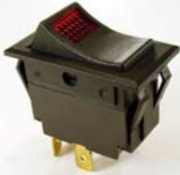
SW - 2704 - A2 - 1L

15A 12V DC/15A 125V AC Mounting Hole: 37X21.8mm SPST ON - OFF With One Lamp