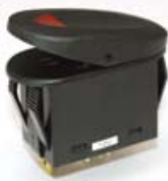
R13 - 271A2

21A 14V DC/20A 125V AC Mounting Hole: 36.8X21.2mm SPST ON - OFF With One Lamp