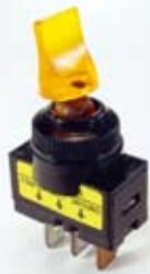
SW - 2773DL - Y

10A 12V DC Mounting Hole: Ø 12.5mm SPST ON - OFF With Lamp