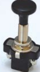
A3 - 5CA

10A 12V DC Mounting Hole: Ø 8.2mm SPST ON - OFF