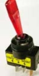
SW - 2773L - R

10A 12V DC Mounting Hole: Ø 12.5mm SPST ON - OFF With Lamp