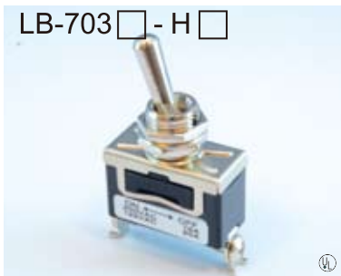
LB-703 □ - H □

SPST(2PINS) 15A 125V AC/10A 250V AC Option of Function: 1.5.7