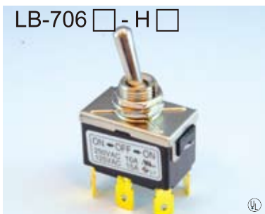
LB-706 □ - H □

DPST(4PINS) 15A 125V AC/10A 250V AC Option of Function: 1.5. 7