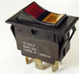
SW - 2706 - A3 - 2L

15A 125V DC Mounting Hole: 37X21.8mm DPDT ON - OFF - ON With Two Lamp