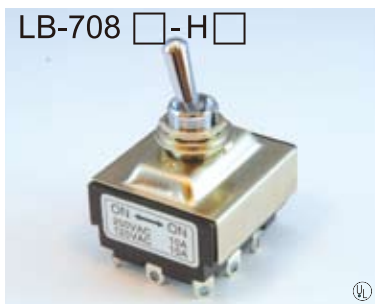
LB-708 □ - H □

DPDT (6PINS) 15A 125V AC/10A 250V AC Option of Function: 2.3.4.6.8.9