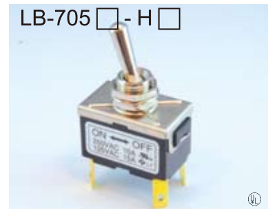
LB-705 □ - H □

SPDT (3PINS) 15A 125V AC/10A 250V AC Option of Function: 2. 3. 4. 6 .8.9