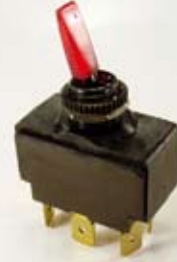
SW - 2726 - CD3 - 2L

15A 12V DC/15A 125V AC Mounting Hole: Ø 12.0mm DPDT ON - OFF - ON With Two Lamp