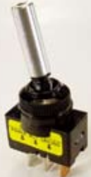
SW - 2775L - R

15A 12V DC Mounting Hole: Ø 12.5mm SPST ON - OFF With Lamp