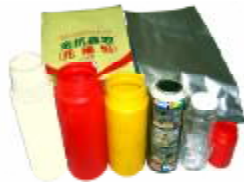
Powder / 粉末